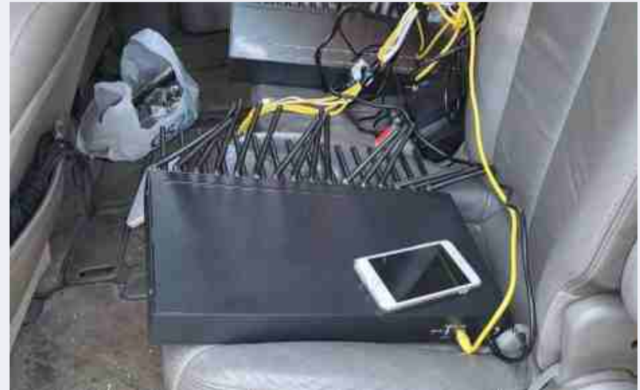
VoIP relaying method

These devices are used to make text messages or phone calls from abroad appear as if they are coming from a South Korean phone number. Since they are intended for criminal purposes, any offer for part-time job that involves turning on multiple phones or relay devices and moving them should be rejected, as it could lead to involvement in a voice phishing crime.