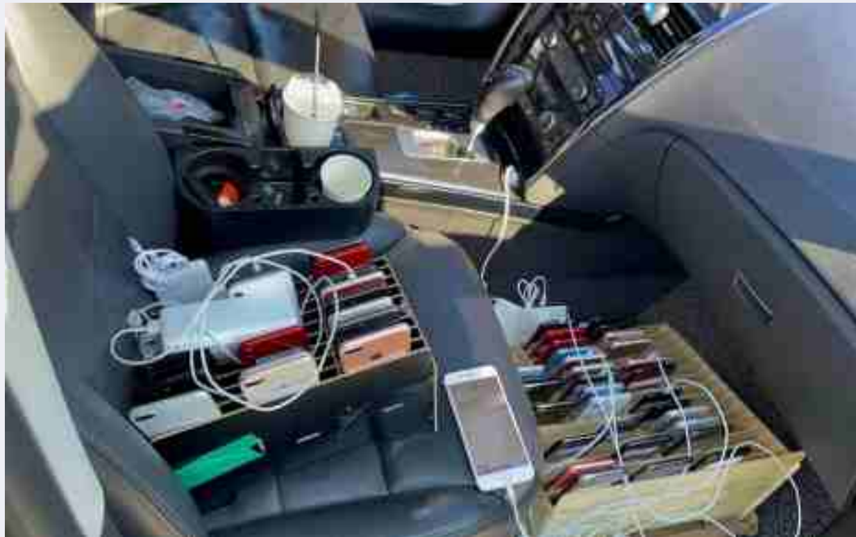
VPN Pairing method

Assisting others in using a VPN or VoIP relay device is also a crime.