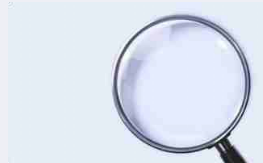
Always Stay Vigilant